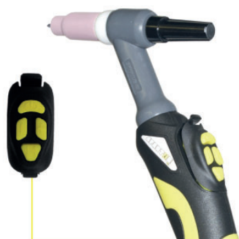
Fast replacement microswitch SPARTUS® Pro 4B with UP & DOWN remote control